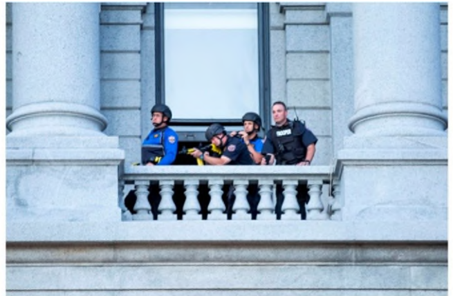
A state trooper aims a weapon at protesters from a Capitol balcony, May 29, 2020.