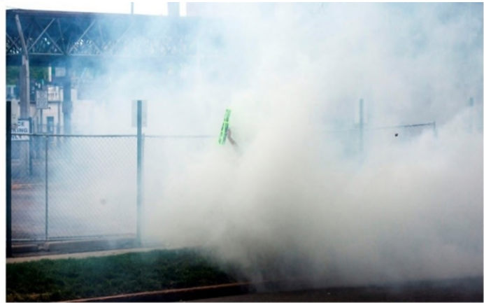
A woman holding a sign outside of Denver Police District Six headquarters on Washington Street disappears into a cloud of tear gas, May 30, 2020.