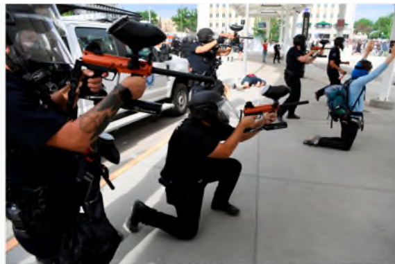
A protester kneels and puts his hands in the air as Denver police officers start firing pepper ball into a crowd of protesters gathered near Colfax Ave and Broadway on the third day of George Floyd protests in Denver May 30, 2020. Protesters are outraged over the death of George Floyd, a 46-year-old black man who was killed by a Minnesota police officer who pinned him to the ground with his knee on his neck.

46. Kinetic impact projectiles have a larger surface area than other ammunition, and thus they take unpredictable flight paths and reduced accuracy is inevitable. 22