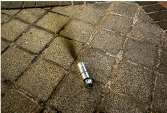
A tear gas canister left after Denver Police officers filled the entire block with the gas to disperse protesters, May 29, 2020.