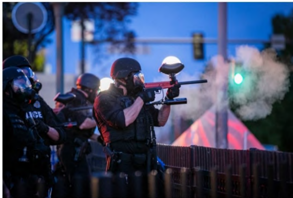
Denver police fire projectiles across Colfax Avenue into a crowd on the west lawn of the state Capitol. Denver protesters angry about the death of African American George Floyd at the hands of a white Minneapolis police officer took the streets for a second day Friday, May 29, 2020.