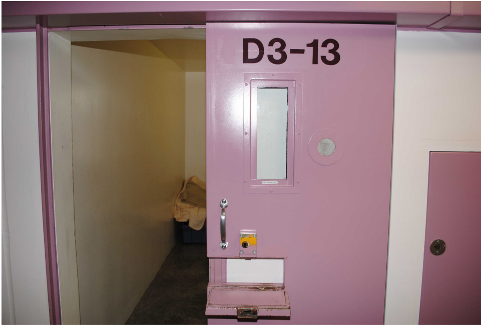
An administrative segregation cell for mentally ill prisoners at Colorado State Penitentiary

For most prisoners in administrative segregation, being handcuffed through their cell doors is the only physical human contact they receive.