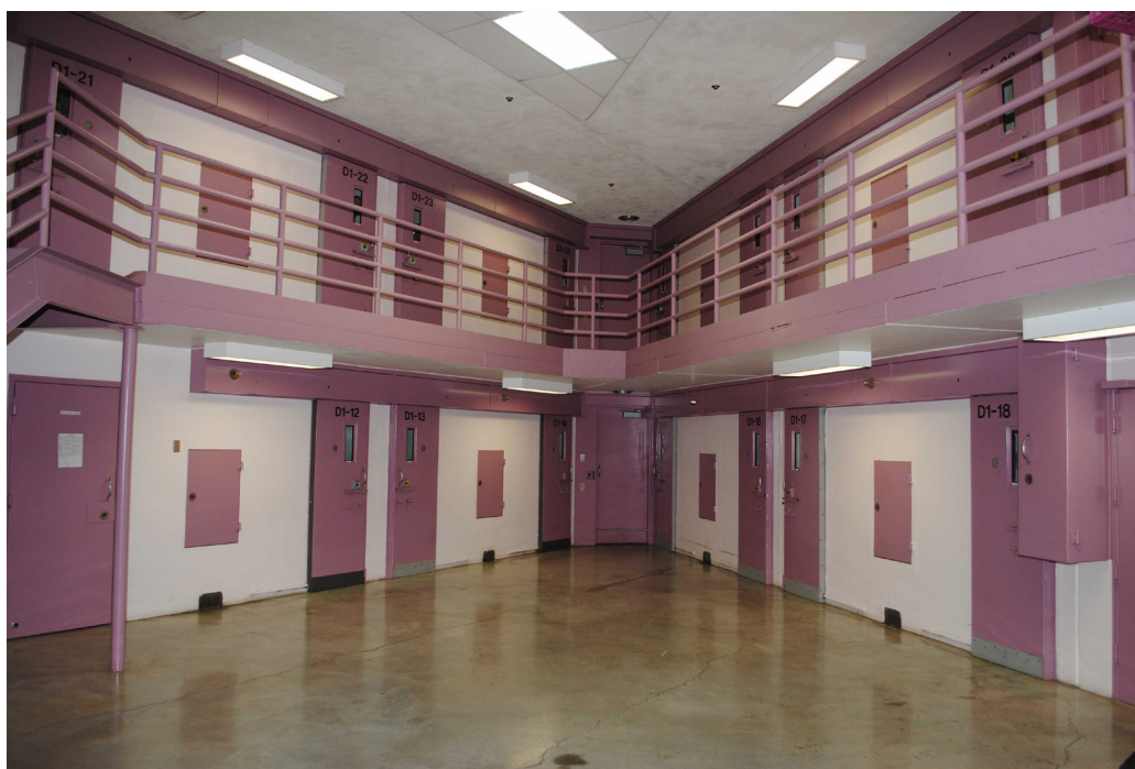
Colorado State Penitentiary Administrative Segregation unit

Similarly, in 2001, the federal court considering conditions at Wisconsin's Supermax Correctional Institution noted "[m]ost inmates have a difficult time handling these conditions of extreme social isolation and sensory deprivation, but for seriously mentally ill inmates,