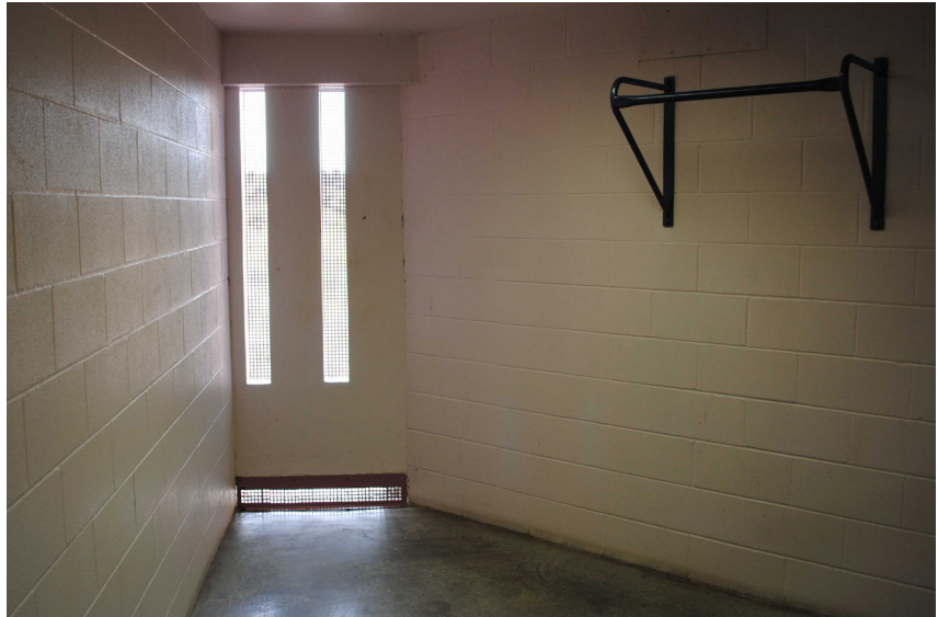
Exercise room at Colorado State Penitentiary for ad seg prisoners