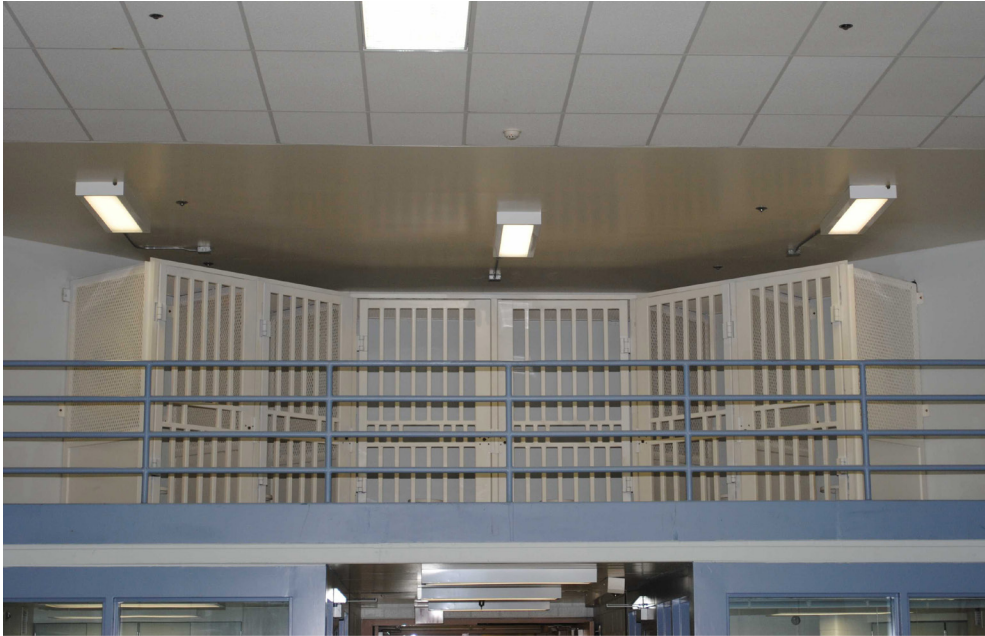
Group therapy cages for mentally ill inmates fortunate enough to be granted therapeutic out-of- cell time