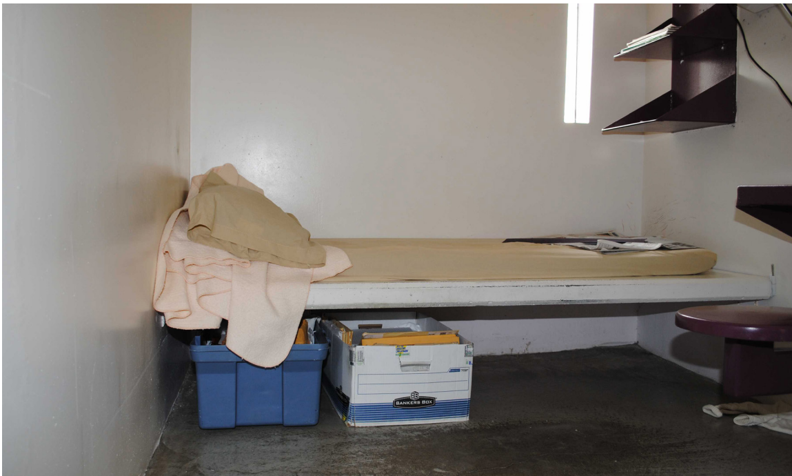
Administrative Segregation Cell