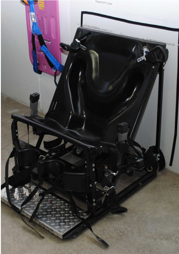
Restraint chair for transportation within Colorado State Penitentiary

John's story lends credence to the wide and growing consensus among psychiatrists that isolation is predictably damaging to seriously mentally ill prisoners. In December 2012, the APA adopted a position statement against segregation of prisoners with serious mental illness. 14 Specifically, the APA espoused that "[p]rolonged segregation of adult inmates with serious mental illness, with rare exception, should be avoided due to the potential for harm to such inmates." The APA clarified that "prolonged segregation means duration of greater than 3-4 weeks" and explained that "placement of inmates with a serious mental illness in these settings can be contraindicated because of the potential for the psychiatric conditions to clinically deteriorate or not improve." 15