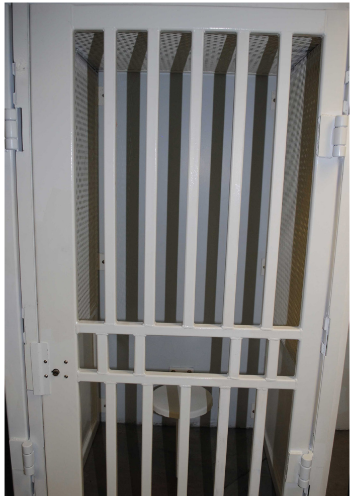
A closer look into the group therapy cages