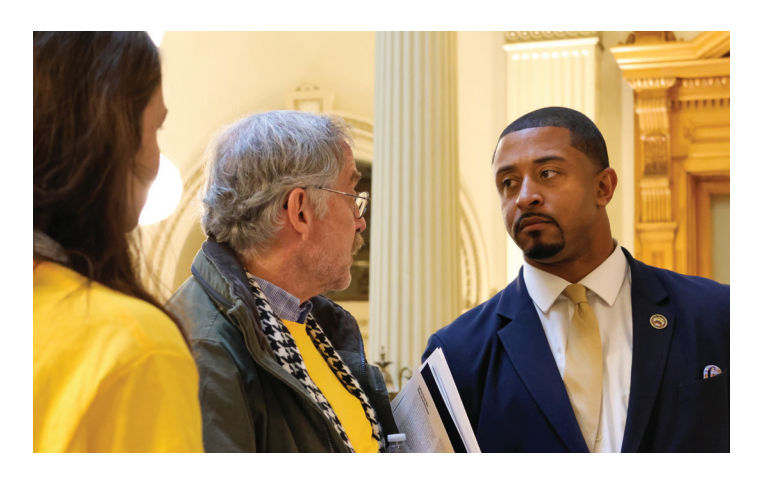
LIFT attendees speaking with Senator James Coleman during Lobbying is For The (LIFT) People 2023.